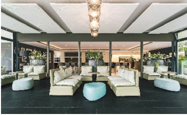
Legend to image 6: ...and now