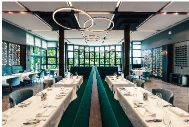
Legend to image 4: ...and now