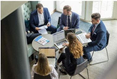
Legend to image 8: SHL today: Business administration questions to a real business case are explained