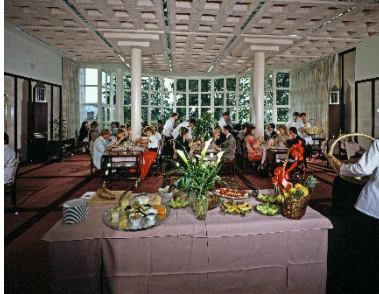
Legend to image 3: SHL's training restaurant then...