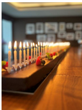
Legend to image 10: Four-meter-long birthday cake with 115 candles