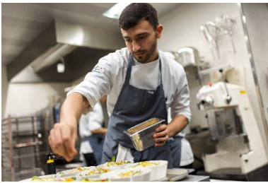
Legend to image 7: SHL today: Semester 1 student working in SHL's training kitchen