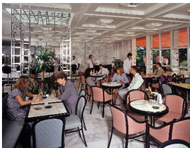
Legend to image 5: SHL Club then...