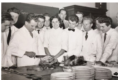
Legend to image 2: SHL then...